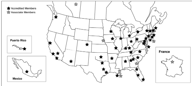
Fig. 1. Map of ASPH Accredited and Associate Members. This map of ASPH membership is from January 2011. ASPH represents the 46 CEPH-accredited SPH and the six associate members that intend to become fully accredited SPH through a formal review process administered by CEPH.

SPH, not just in the US but internationally with inclusion of an accredited school in Mexico and an associate member school in France, which is in the process of accreditation. ASPH membership includes all CEPH-accredited member schools, 46 in 2011 (Figure 1), 16,17 which together, graduate over 8,000 students each year.